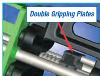
Double Gripping Plates

● Increased durability — Albion's legendary double gripping plates and steel trigger means increased durability; if it's dropped it won't break.