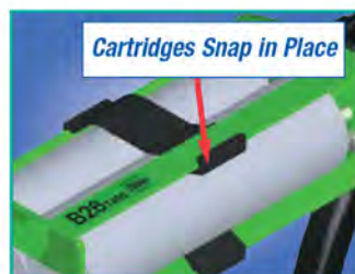
Cartridges Snap in Place

● Increased efficiency — Albion's improved pump efficiency means you get the job done quicker. Designed so that it takes fewer pumps to empty a cartridge, you get more efficient use of hand motion.